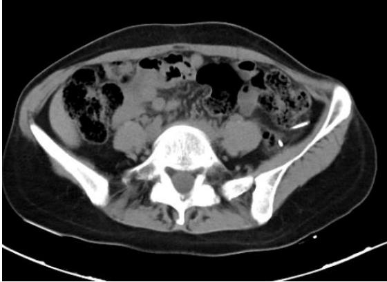
Figure 2. Abdominal CT scan image

The patient was given Cefazolin-sodium and taken to the operating room for a diagnostic laparoscopy. IUD was removed from sigmoid colon with the omental fat around. The operation was successful, and the patient was discharged 1 day later with cure.